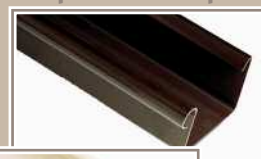
3 profiles shapes