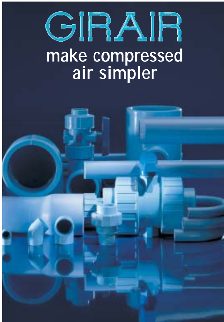
Compressed air pipework system